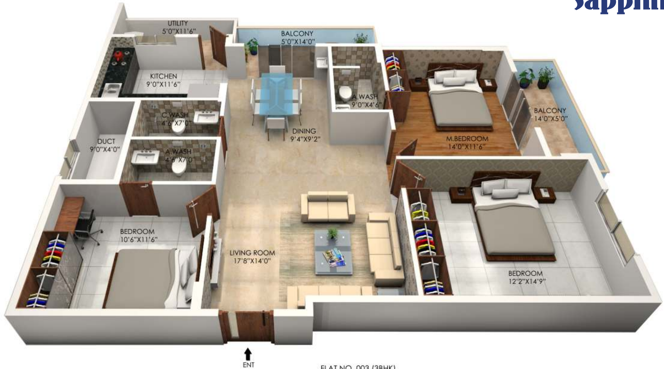
FLAT NO. 003 (3BHK)